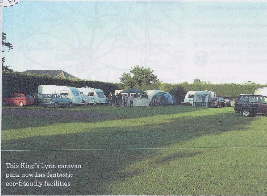
This King's Lynn caravan park now has fantastic eco-friendly facilities